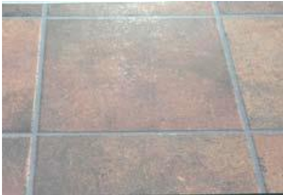
Often marketed on the basis of being easy to clean, Vinyl floors emit phthalates.

system. Phthalates are also suspected to be potent reproductive toxins, especially in boys.