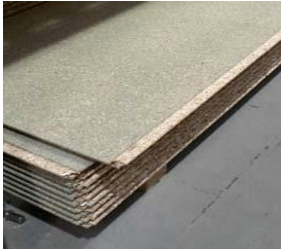
Chipboard is a ubiquitous construction material. It is usually bonded together with Phenol Formaldehyde resin. In addition it is sometimes treated with preservatives of a type banned in the USA

Formaldehyde is present in significant quantities in a wide range of house furniture, insulation and floor and wall fittings. It is used in hundreds of industrial processes including the manufacture of particle boards, MDF, chipboard and plywood, thermal insulation foams, adhesives, glues and resins.