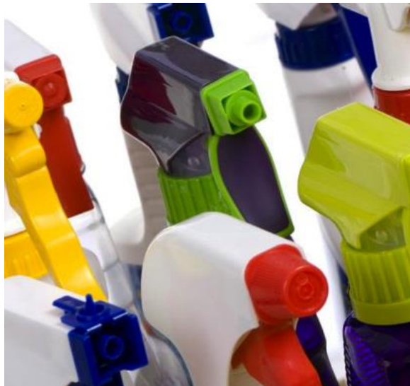
VOCs are commonly found in paints, adhesives, cleaning supplies, composite wood products and furniture.

VOCs are chemicals that are emitted as gases from certain solids or liquids at room temperature. There are 50 – 300 chemicals that can be classed as VOCs in the average indoor environment. The main sources in domestic environments are paint, floor sealant, vinyl and furnishings.