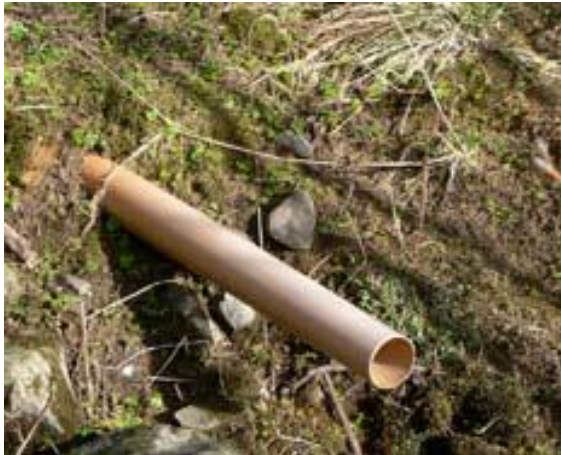
PVC Pipe routinely used inside and out

Throughout the lifecycle of PVC and other chlorinated plastics, through manufacture and disposal, the chlorine content has the potential to produce dioxins. Dioxins are an unavoidable by-product of the manufacture, combustion, and disposal of materials containing chlorine, which can create dioxins both when the products are manufactured and when they burn in structural fires or at the end of their useful life in incinerators or landfill fires. Dioxins include some of the most potent carcinogens known to humankind.